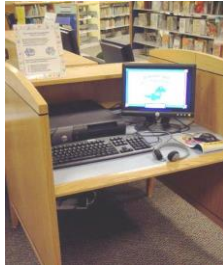
PAC (Public Access Catalog)