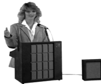
Wireless Lavalier Microphone