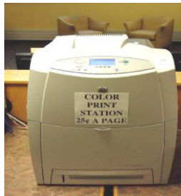
HP LaserJet 4600 Color Printer