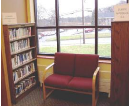
An Oak Bench & Bookcases for the Classics Alcove