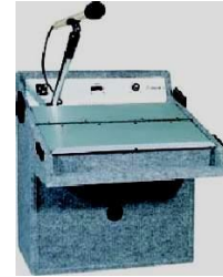
Portable Address System